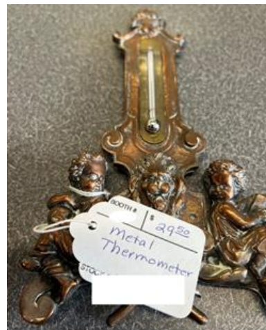
Ornamental Mercury Thermometer