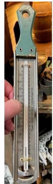
Deep Frying Mercury Thermometer

If one of these devices are accidentally broken, the mercury must be cleaned up properly to limit exposure. The cleanup can be very expensive and is generally not covered by insurance policies. It may even require temporary evacuation. For details on mercury spill clean-ups, see the Department of Health and Human Services (DHHS) Webpage at Michigan.gov/Mercury .